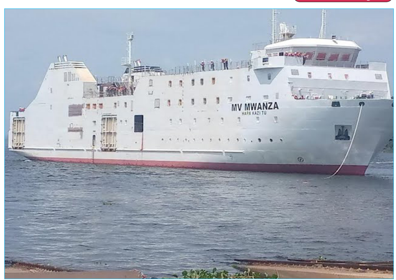
MV Mwanza - Hapa Kazi Tu

Minimum number of days given to a tenderer to prepare and submit prequalification documents and tender in the national competitive tendering method.